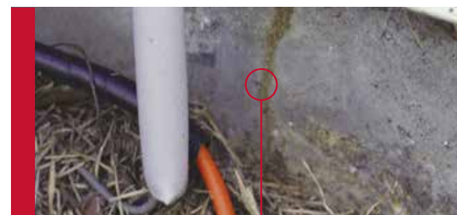
Mud or Shelter Tube

Termite stations are strategically installed around the perimeter of your home, typically in landscape beds adjacent to the home.